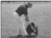
3. Back up as you bring your treat hand close to your body