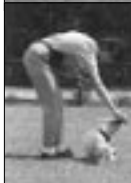
2. Slowly move your treat hand counter-clockwise