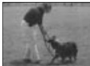
4. Click and reward your dog when he reaches you