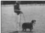
1. Starting position