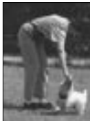
1. Hold the treat in front of your dog's nose

Note: Initially, it may be easier to lure your dog forward with the treat hand to get him started into the spin movement. You can also use your leash to guide your dog into a counter-clockwise direction if needed. Visit