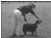
2. Hold the treat in front of your dog's nose when he becomes distracted